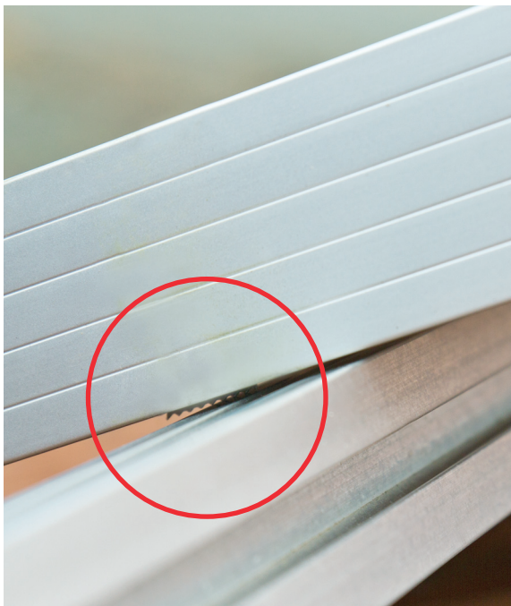
Place the module on the profile rail