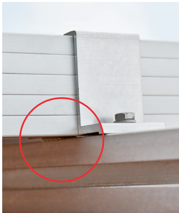
Hook the middle or end clamp onto the profile and tighten.